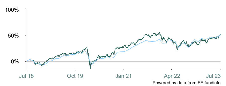
Australian Ethical Diversified Shares