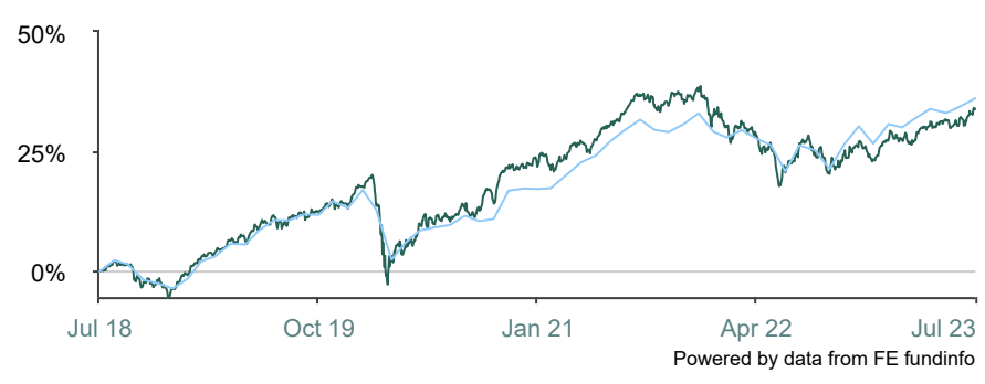
Australian Ethical Balanced