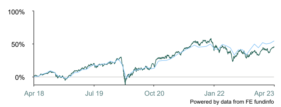
Australian Ethical Diversified Shares