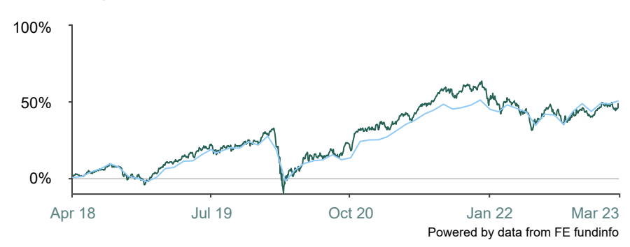
Australian Ethical High Growth