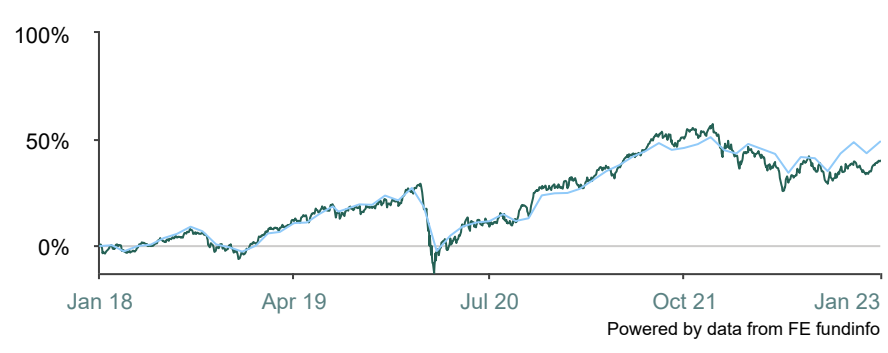
Australian Ethical High Growth