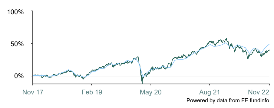
Australian Ethical High Growth